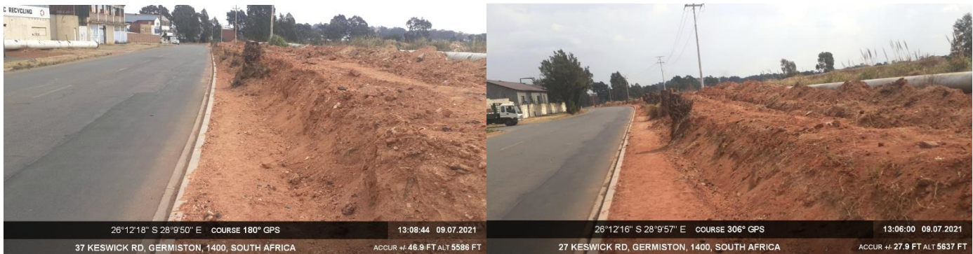
Figure 1-4: Shows the areas that require seeding and cutting of tree stump along the J7 the pipeline. The area for seeding is approximately 700mx10m=7 000m 2 .

The entire scarred area to be seeded must be scarified either mechanically or manually in order to provide suitable conditions for grass germination and minimize water/wind disturbances. Soil is to be scarified to a minimum depth of not less than 60 mm and with a scarification spacing of not more than 200 mm apart. The final levels of the area to be prepared should tie in with existing hard landscape levels. All rubble, stones and other foreign objects must be removed and disposed of at approved dumping site. Proof of dumping needs to be obtained and submitted to Rand Water.