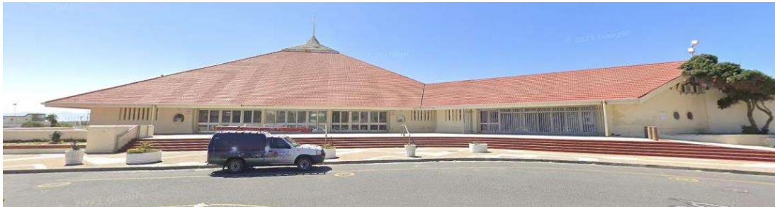
MUIZENBERG CIVIC CENTRE – BEACH ROAD, MUIZENBERG

CITY OF CAPE TOWN SPATIAL PLANNING AND ENVIRONMENT: ENVIRONMENTAL MANAGEMENT DEPARTMENT CONTRACT NO. 144Q/2023/24 MUIZENBERG SEAWALL REPLACEMENT AND BEACHFRONT REFURBISHMENT