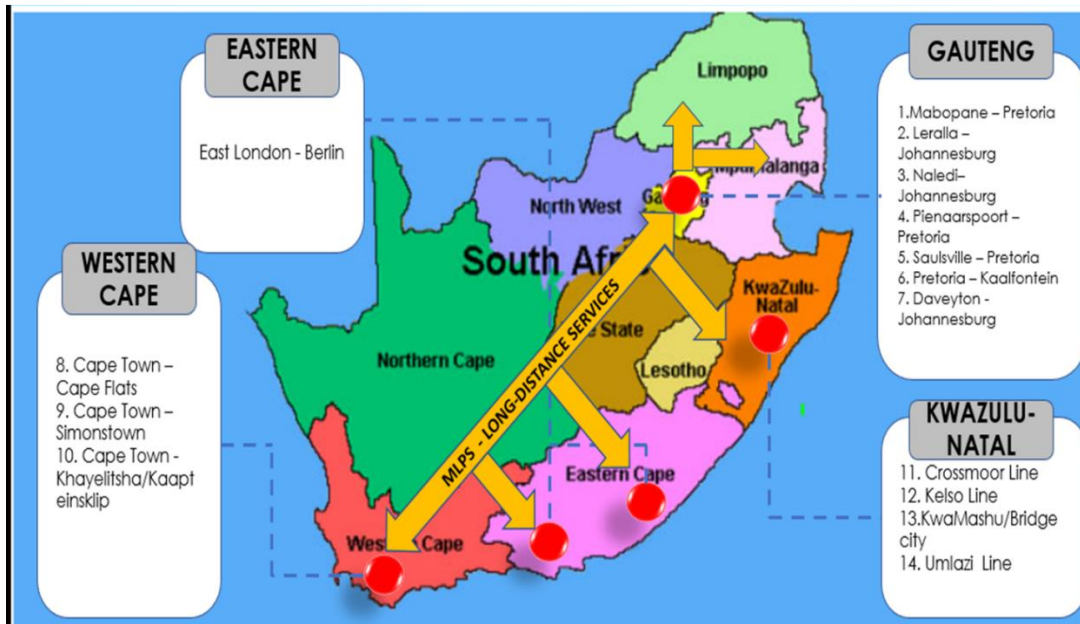
Figure 1: Eastern Cape Corridor diagram

The 15 corridors (including Eastern Cape Region) are as below: