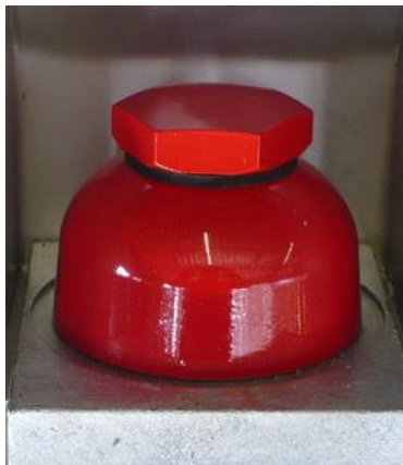
Figure 1: Spark gap