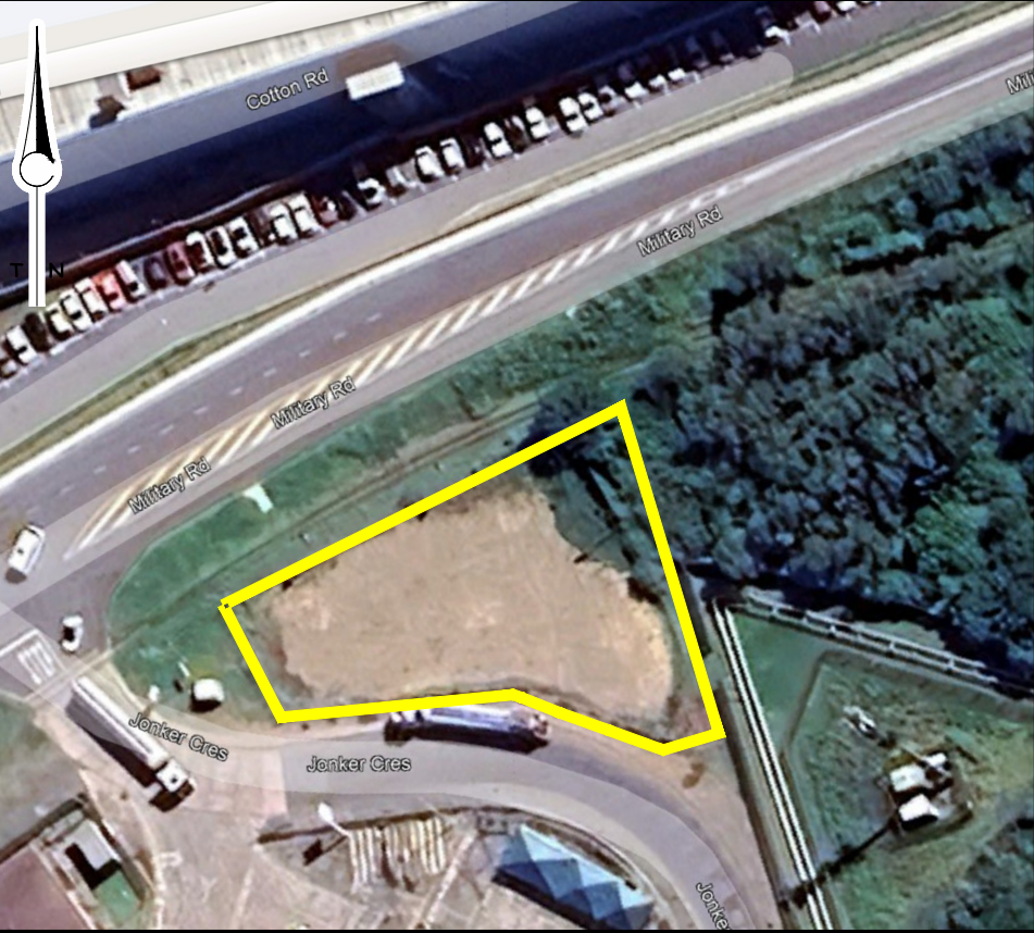
AERIAL PHOTO NOT TO SCALE