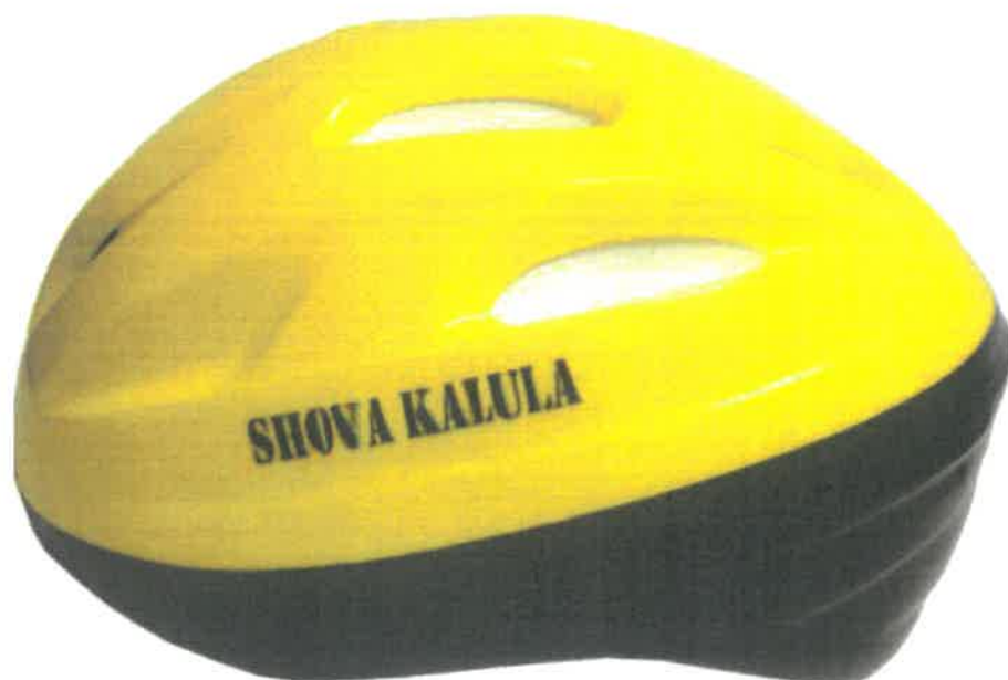
FIG 3. SPECIFICATION FOR TWELVE THOUSAND (12 000) SHOVA KALULA BICYCLE HELMET GM-105).