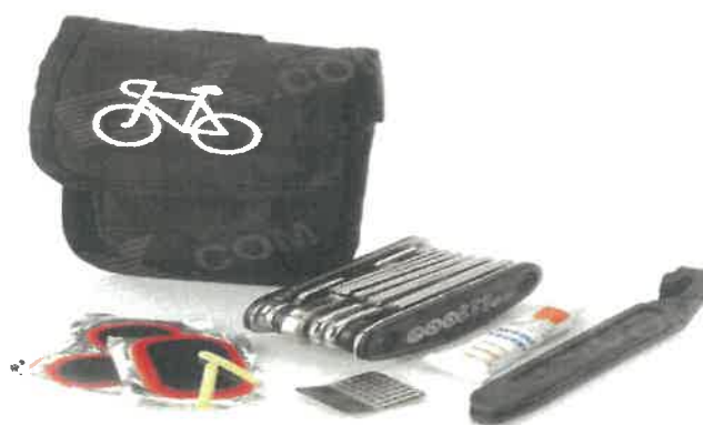
FIG 7. SPECIFICATION FOR PORTABLE AND MULTIFUNCTIONAL BICYCLE REPAIR TOOL KIT

NB: Note that bicycle helmets, pumps, locks as well as visibility safety lightweight cycling reflective vest must form part of the specifications and prices for these five (5) items must form part of the costing for the individual bicycle.