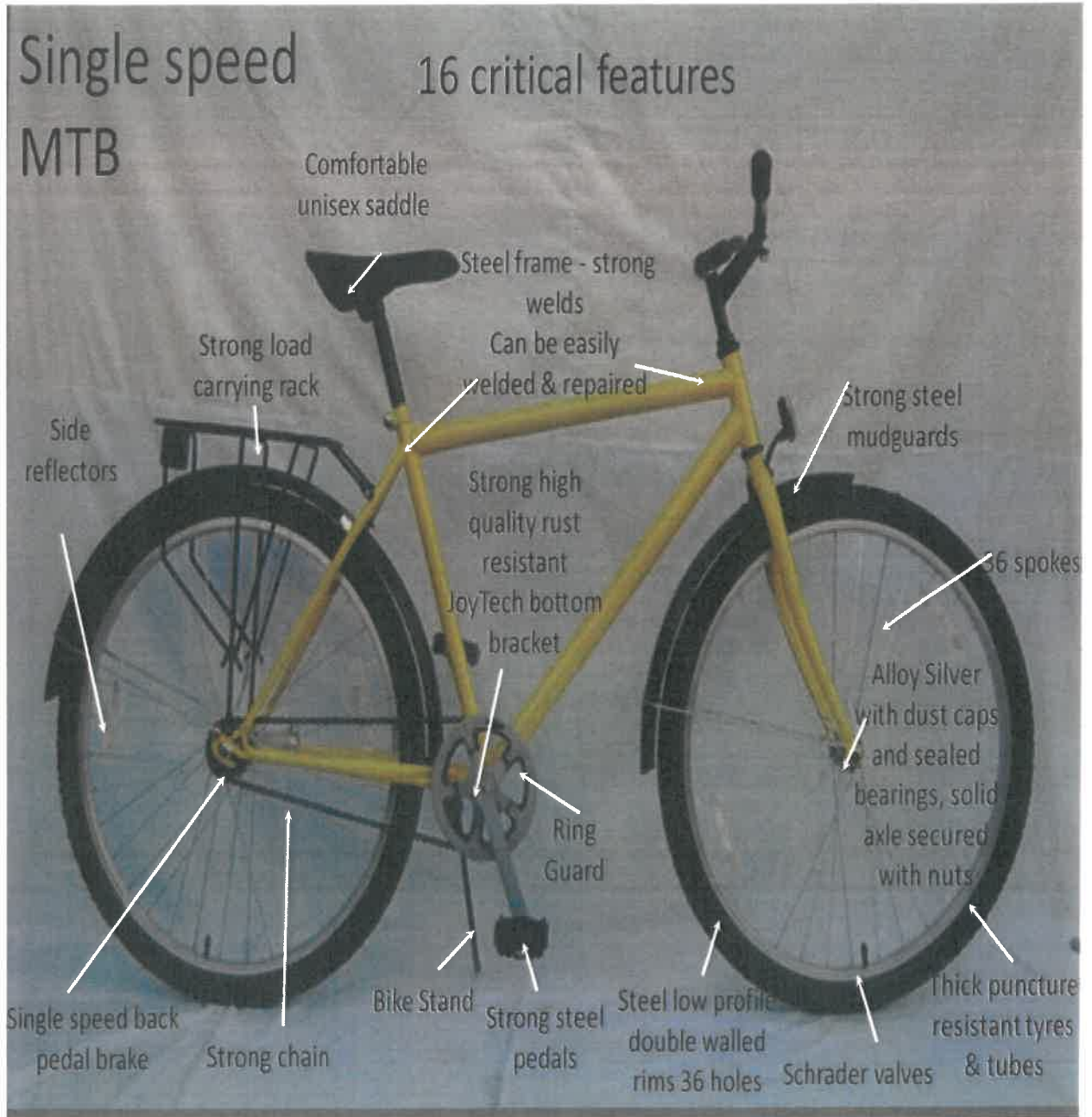
FIG 2: BICYCLE SPECIFICATION: SHOVA KALULA BICYCLE

The twelve thousand (12 000) Shova Kalula unisex bicycles shall comply with all specifications developed and approved by the Department as outlined in the table below: