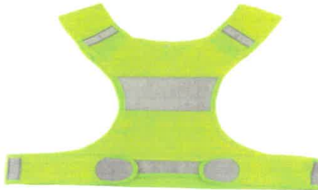
FIG 5: VISIBILITY SAFETY LIGHTWEIGHT CYCLING REFLECTIVE VEST