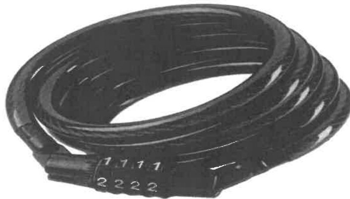
FIG 4: SPECIFICATION FOR TWELVE THOUSAND (12 000) BICYCLES LOCKS 1.5 METER 4 DIGIT COMBINATION PLASTIC COVERED CABLE LOCK.