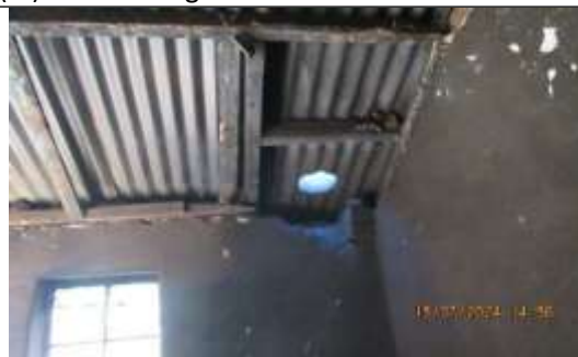
( p ) Wall cracks & Burnt roof beams, room 3