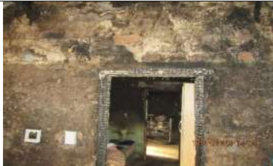
( i ) Burnt Door Frames in Room 2