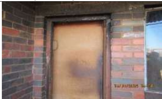
m) Burnt door front door and frame