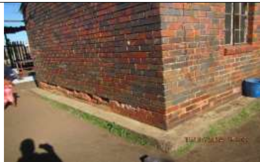
( l ) Chipped bricks outside room 1