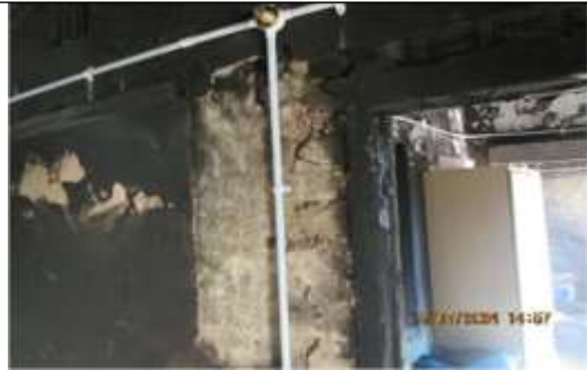
( j ) Burnt door frame & cracked wall room 1