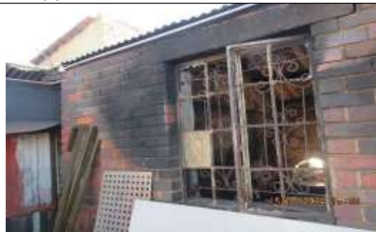
( n ) Fire damage room 2 window external