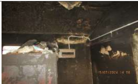
k) Damaged Ceiling in room 1