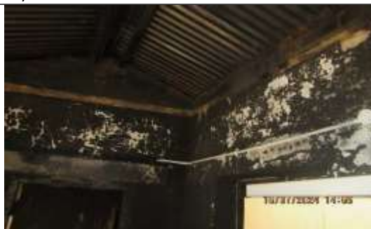
o) Wall damage in room 3