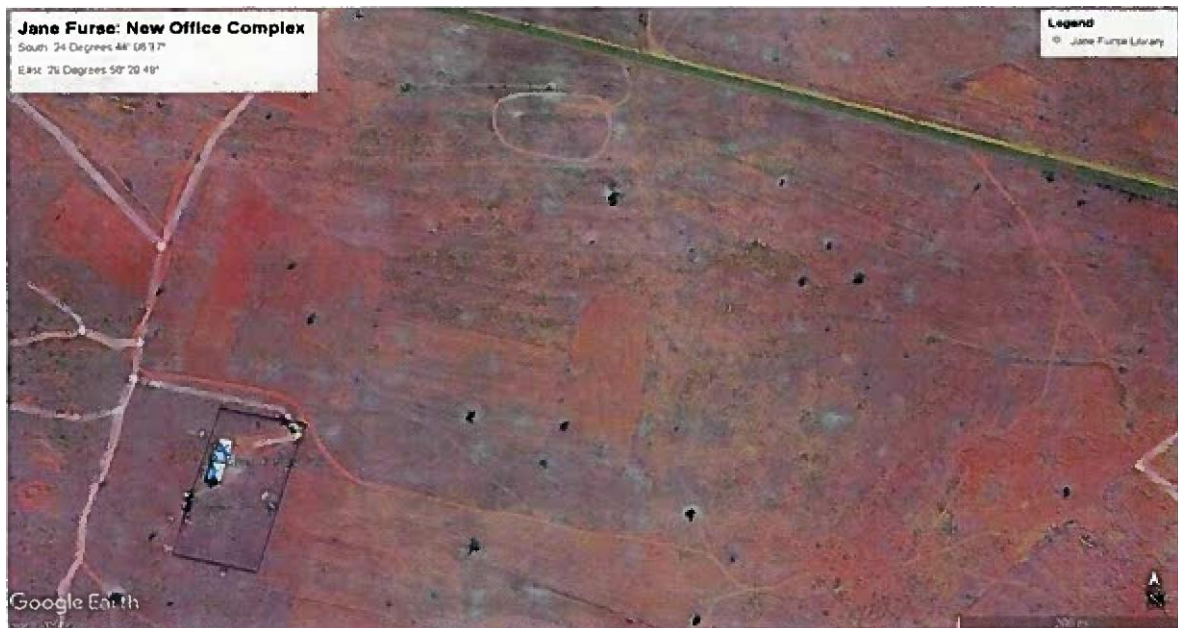
Figure 1: Locafity Plan

South: 24° 44' 06.37" & East: 29° 50' 29.49".