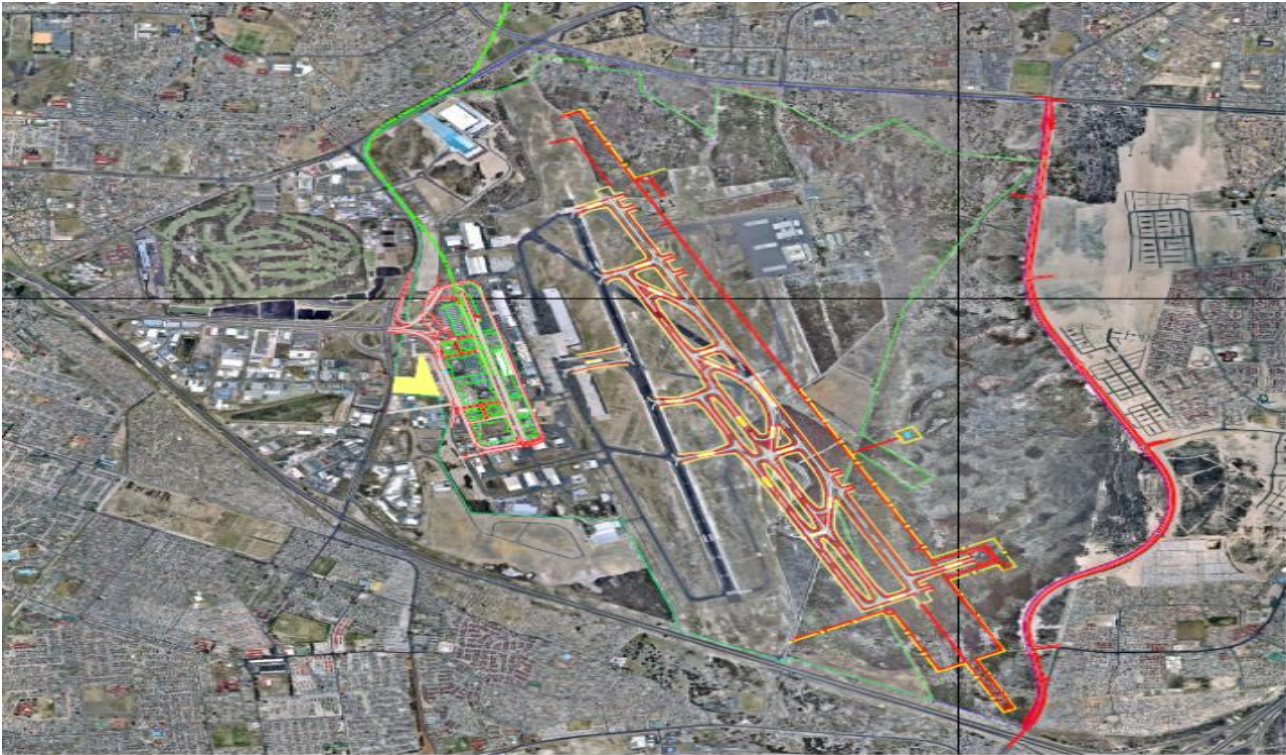
Figure 4: Site Locality Plan – site boundary marked in red