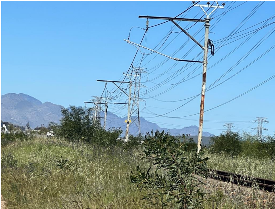
Figure 2 Damaged OHTE Lines