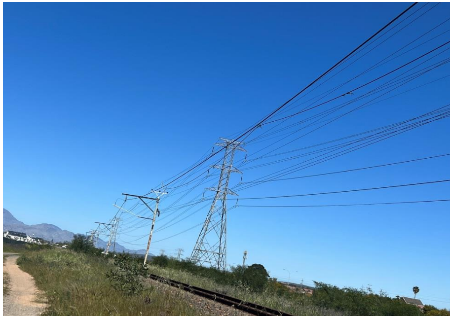
Figure 4: vandalised and Stolen OHTE