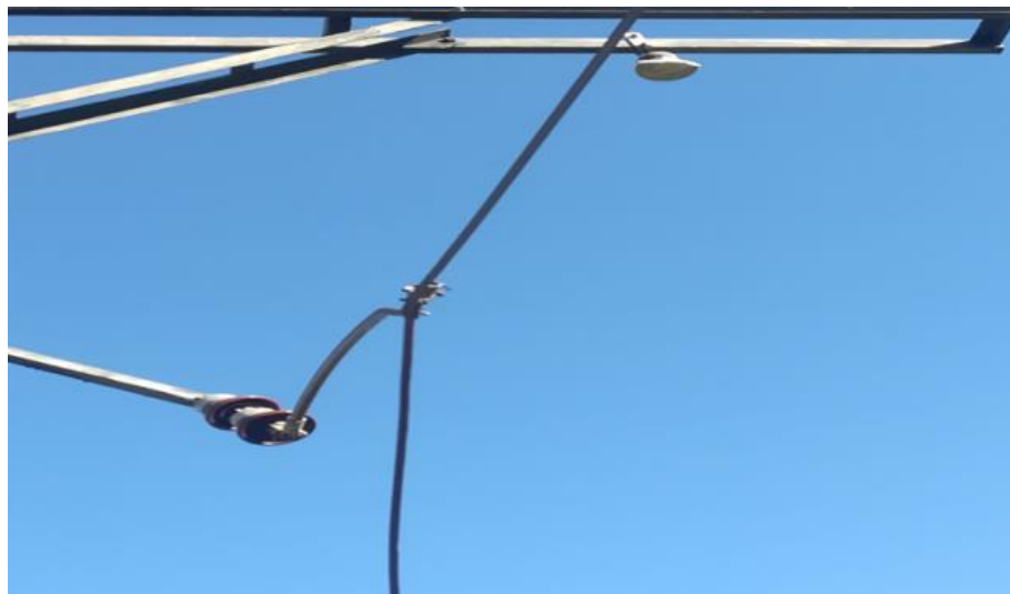
Figure 3: OHTE Vandalized