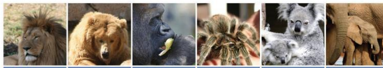
Heart of Africa A2,3 Bears A2 Gentle Giants A2 Critters & Cobwebs C2 Australia A2 Elephants C2

Our new Zoo Loop was created to make your experience at our Zoological Gardens more fun, more exciting and much easier. Simply follow the teal coloured line on the map, as well as the signage throughout the Zoo. Should you veer off the route, simply follow the clearly marked signs back to the teal Zoo Loop! Enjoy yourself!