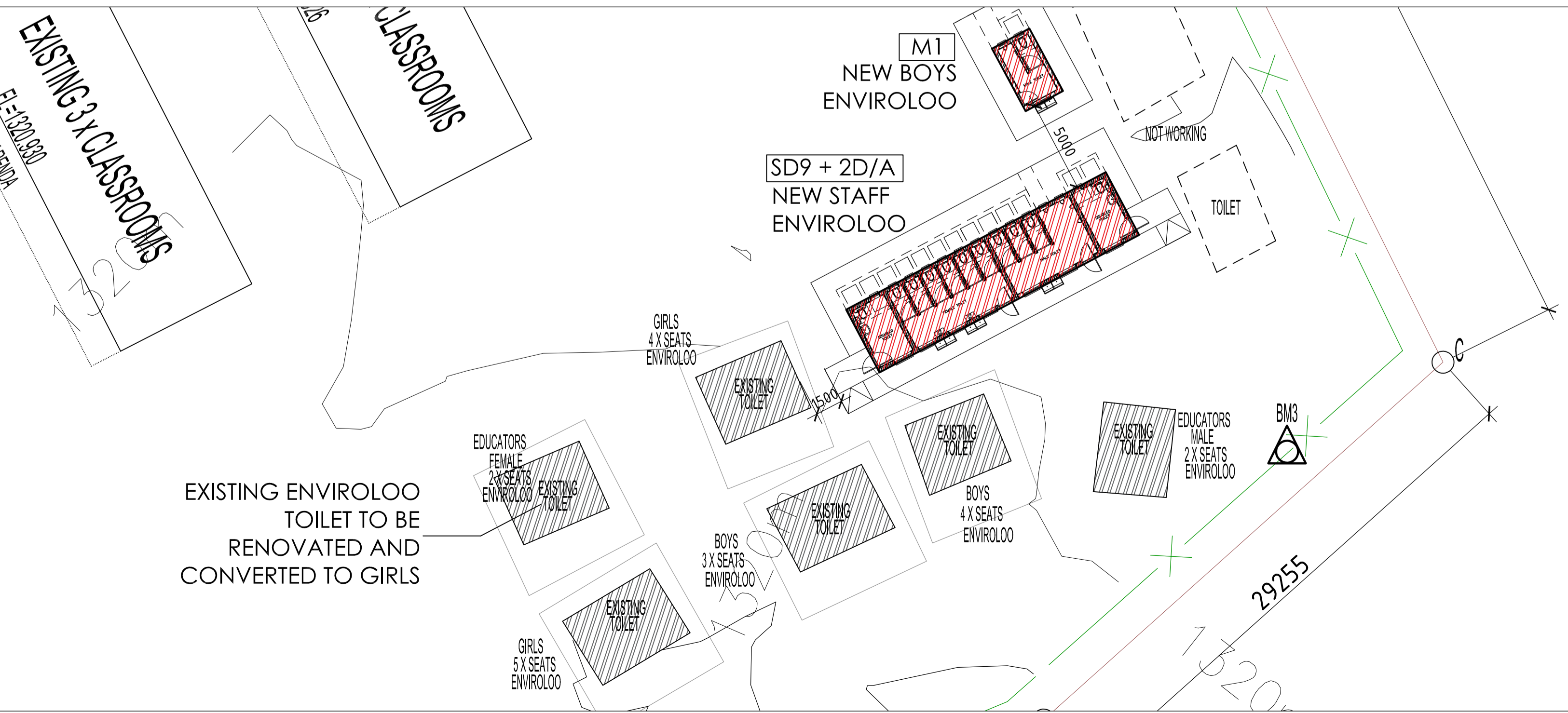
SDP SITE DEVELOPMENT PLAN Scale 1:1000