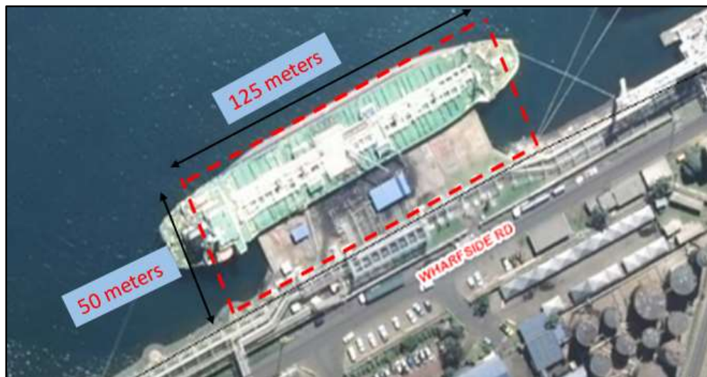
Figure 3: Dashed Red line indicating the Site Boundary

The parameter boundaries are mapped out in Figure 2. Waterside Parameter is the entire berth pocket, from the landside to the edge of the berth pocket. The landside parameter between bollard numbers "L" and "K".