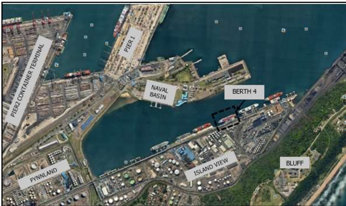
Figure 1: Aerial View of the Island View Berth 4 and surrounding areas

Island View Berth 4 is located in the Port of Durban within the Island View Precinct. The Berth is a chemical berth. The berth is classified as a zone 1 hazardous area. The structure comprises of two mooring dolphins on either side which was built prior to 1952. The dolphins were later conjoined with a 150 millimetre thick deck on pile concrete structure which was constructed in 1986.