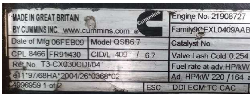
Figure 2: Cummins engine data plate