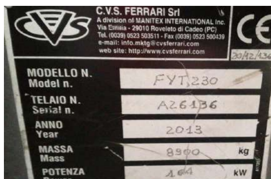
Figure 1: Data plate for a CVS FYT230 Ferrari Hauler

Refer to below details of Hauler & Engine.