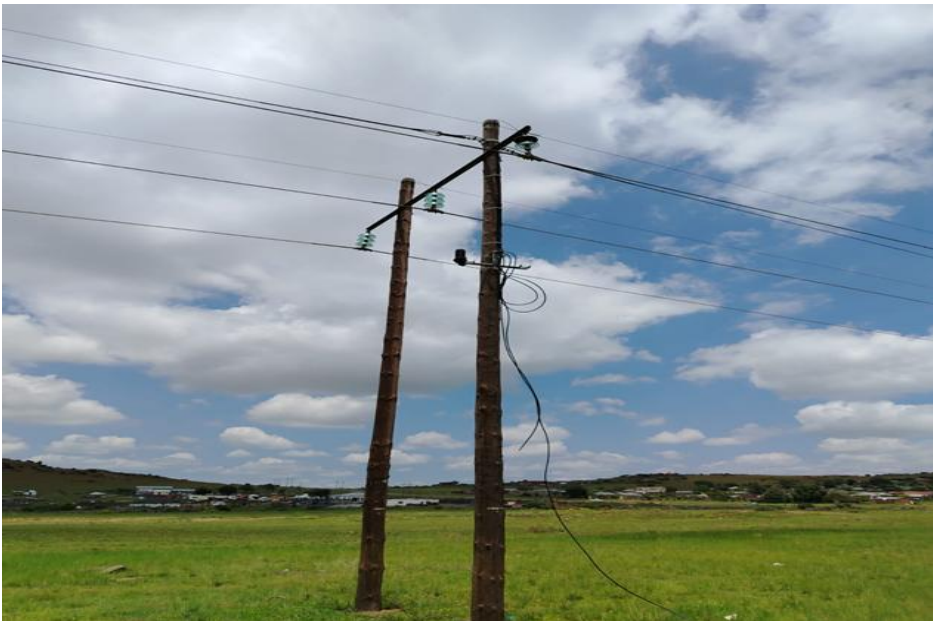
Figure 1 - Fiber Optic Cable Between Botshabelo B and K Distribution Centres

Refer to Figure 1, which shows the damaged fiber optic cable.