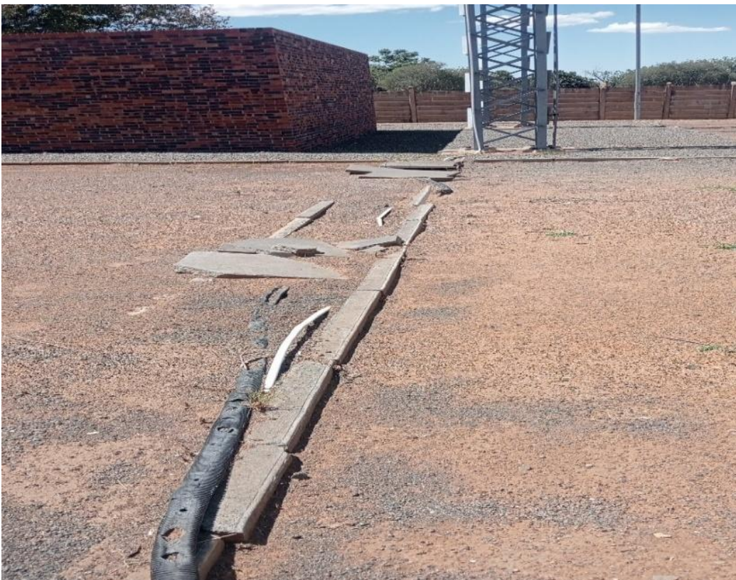
Figure 3 - Fiber Optic Cable at Parkwest DC