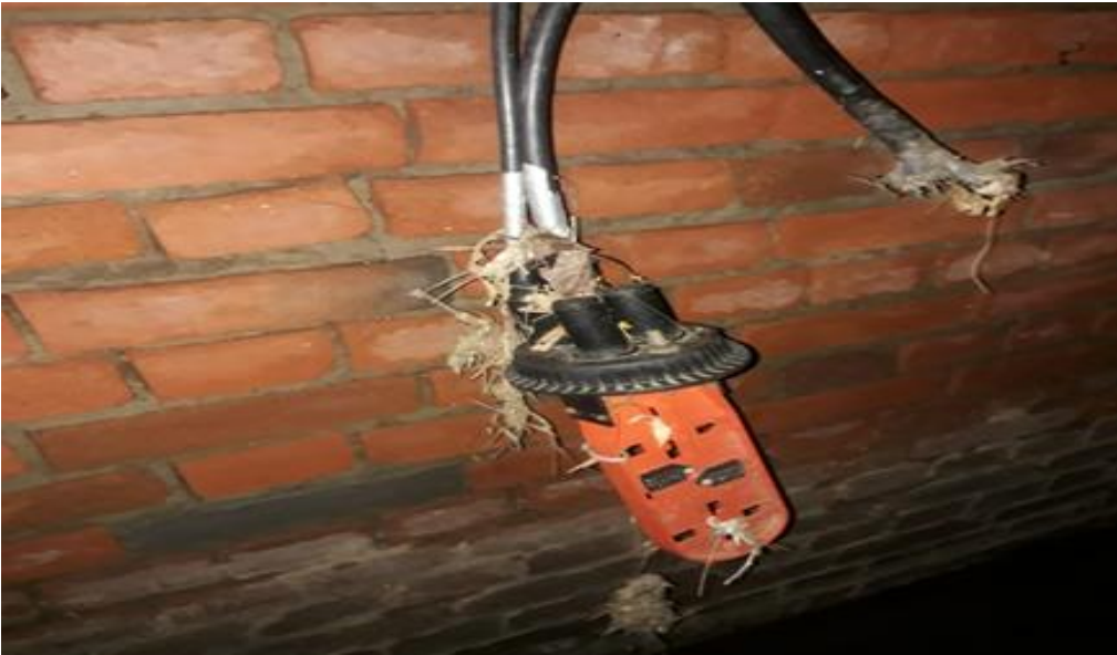
Figure 4 - Fiber Optic Cable at Willows DC