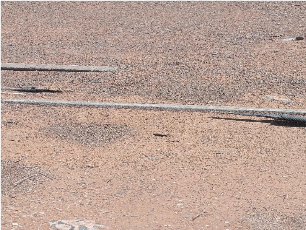
Figure 2 - Fiber Optic Cable at Parkwest DC