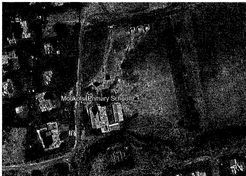
Figure 1: School Block Layout