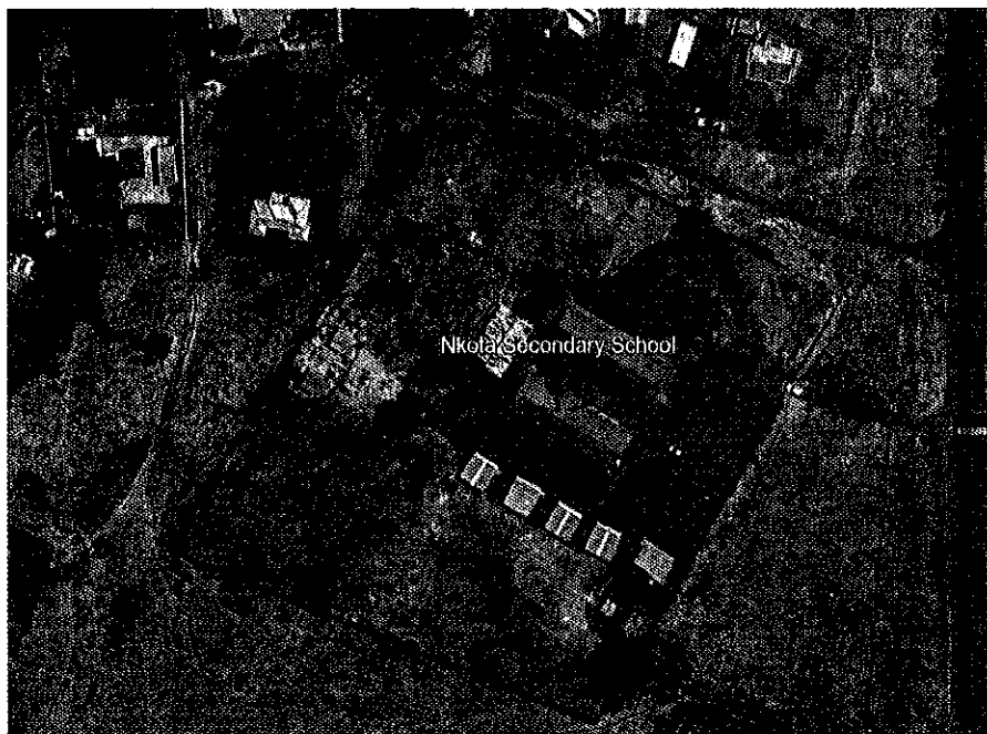
Figure 1: Locality