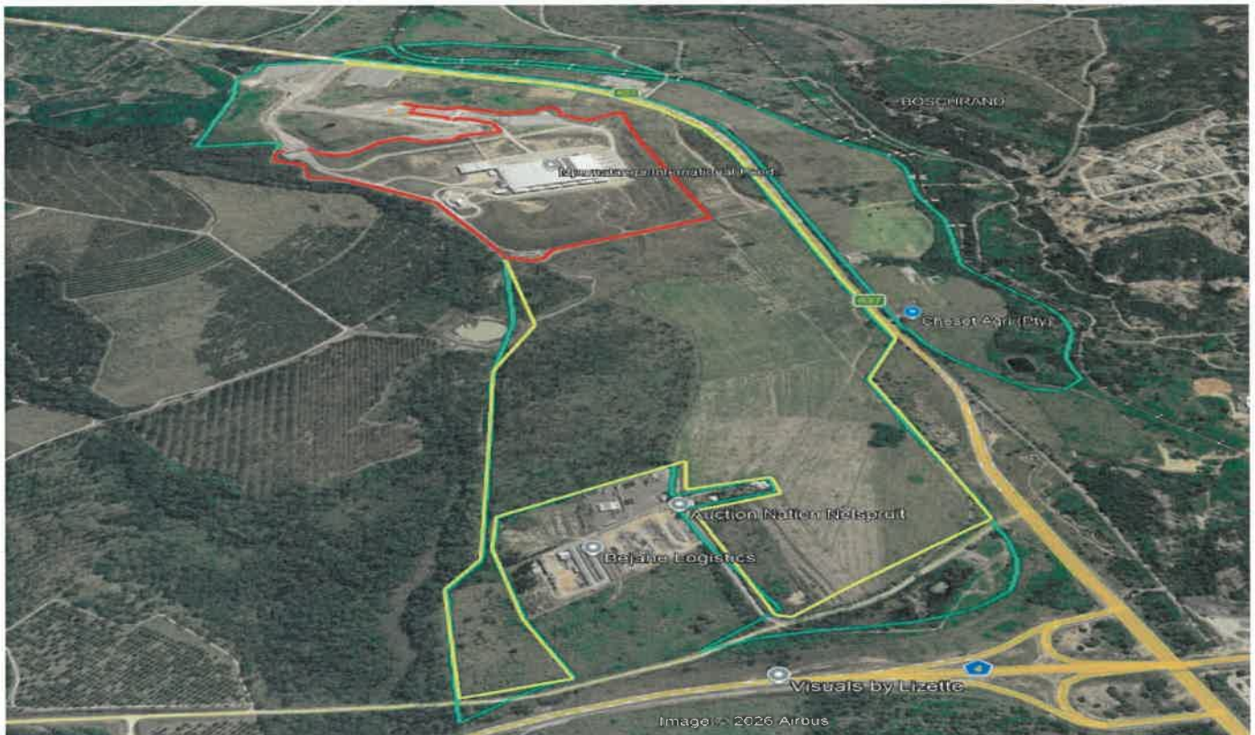
Figure 1: Layout of the MIF property

MIF site is located in the Mpumalanga Province in the City of Mbombela Local Municipality. The site can be accessed through the R37 road to Lydenburg or through the R40 road to White River. The site location can also be described by the following coordinates: Latitude: 30° 56' 28.37" S and Longitude: 25° 26' 05.60" E