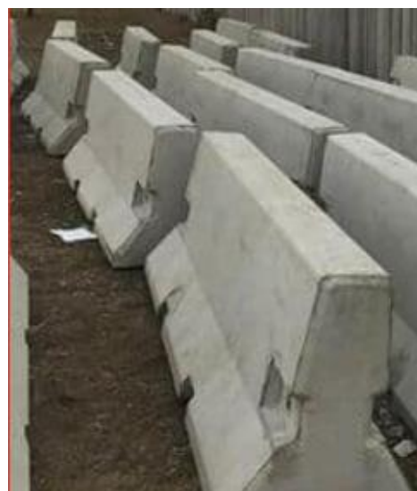
Figure 2: Example of Concrete New Jersey Barrier