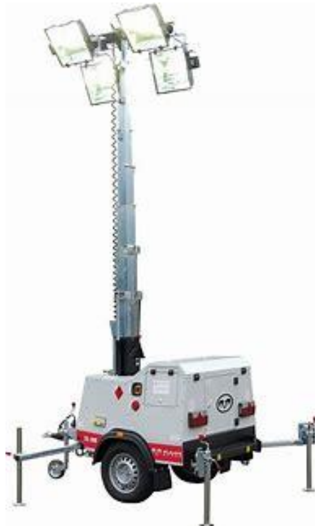
FIGURE 1: SAMPLE OF A MOBILE FLOODLIGHT AS PER SPECIFICATION BELOW: