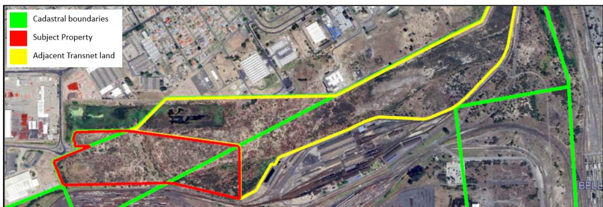
Figure 1: Access to adjacent Transnet owned properties.