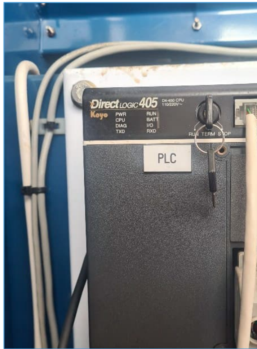
Figure 2 - Existing PLC