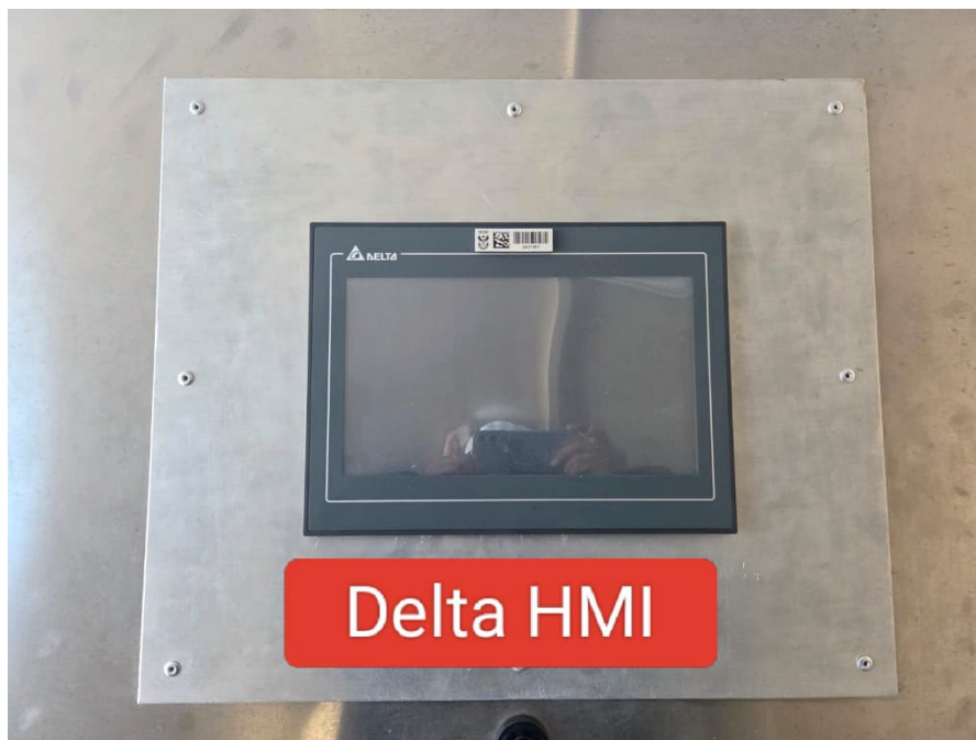
Figure 6 – HMI