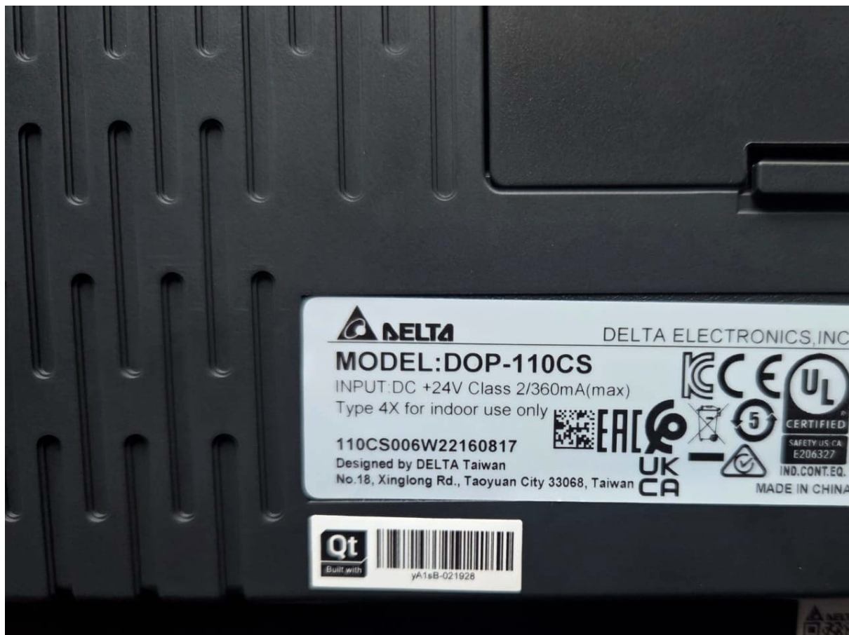
Figure 7 – HMI details