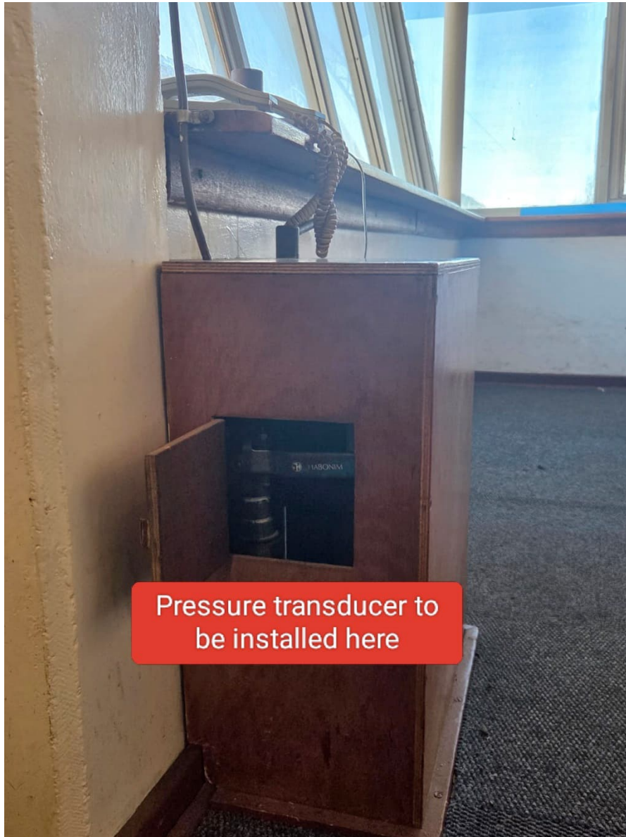
Figure 4 – Pneumatic airline gauge