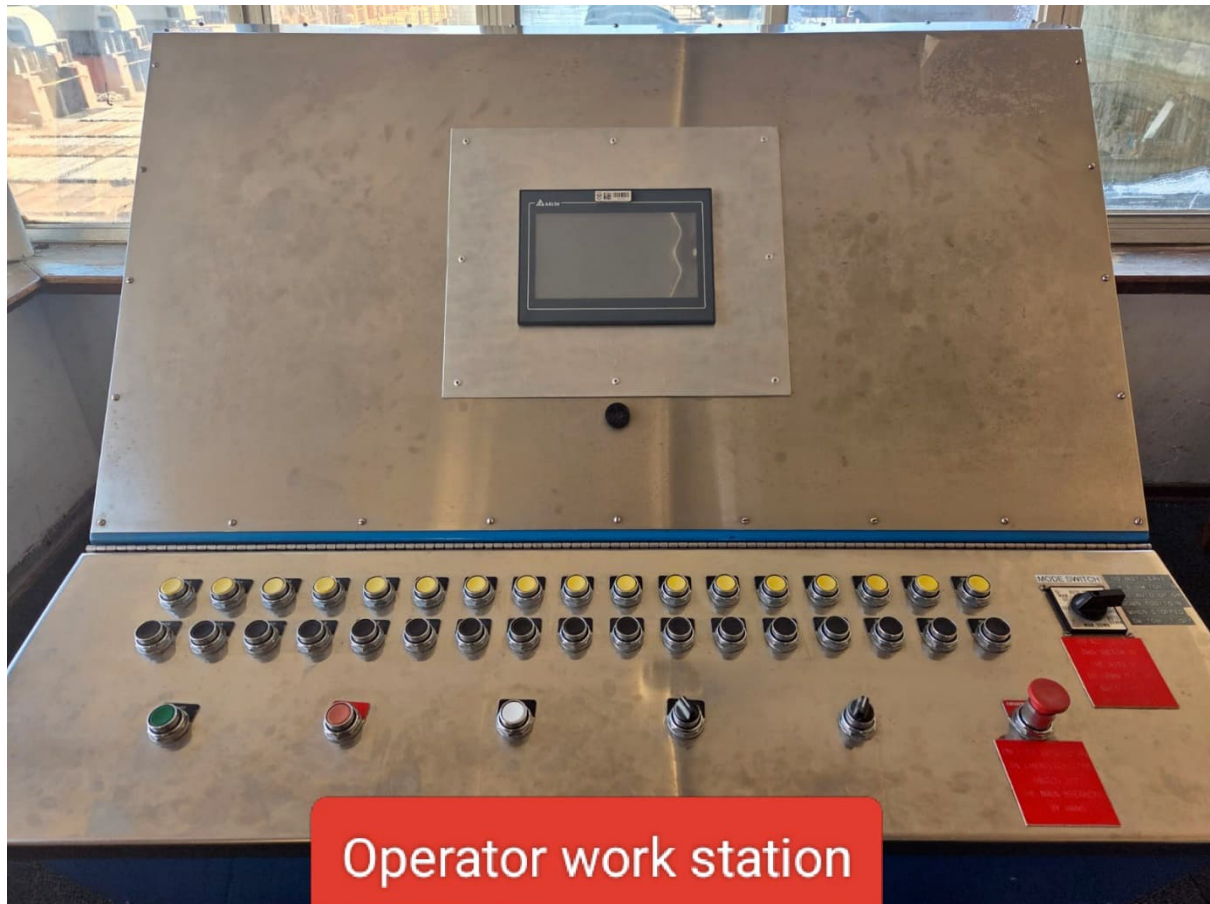
Figure 1 – OWS