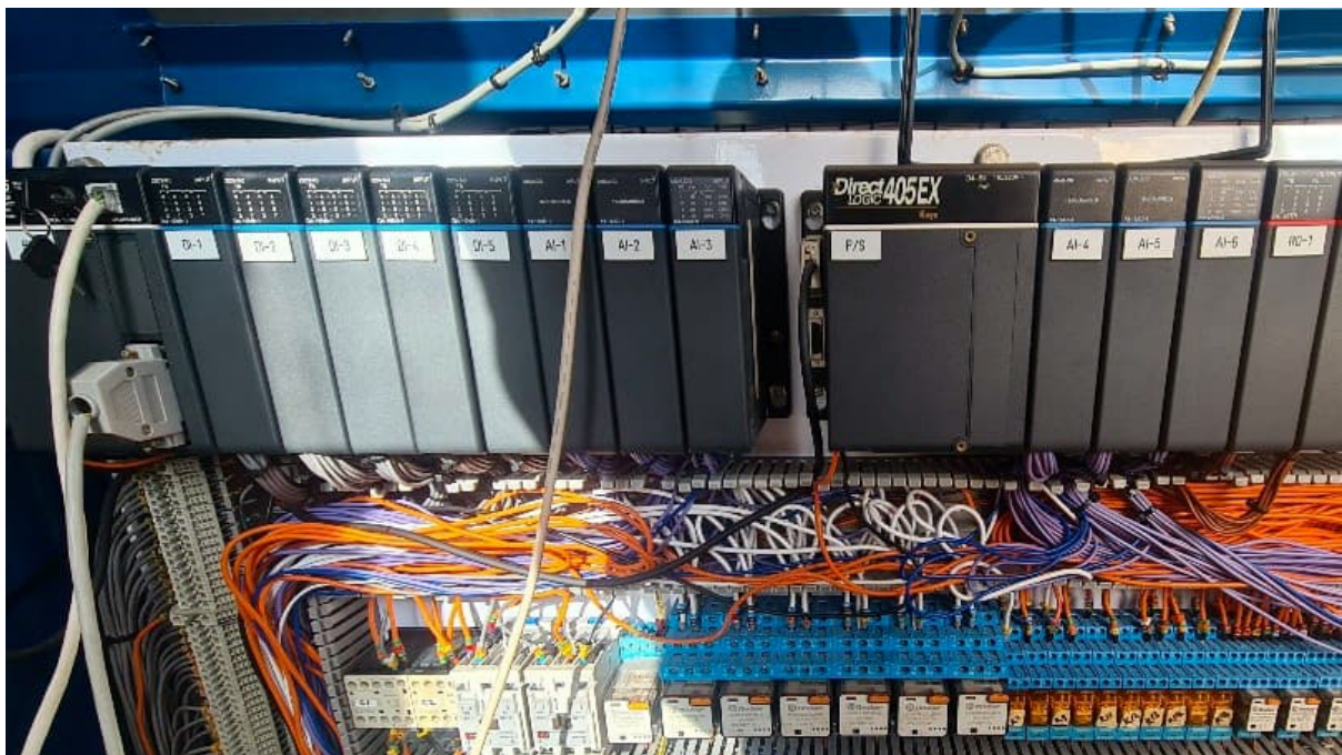
Figure 3 - Syncrolift Control System wiring