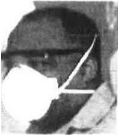
Disposable Asbestos/Silica Dust Respirator