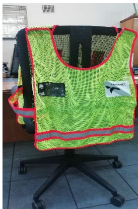
Reflector vest front