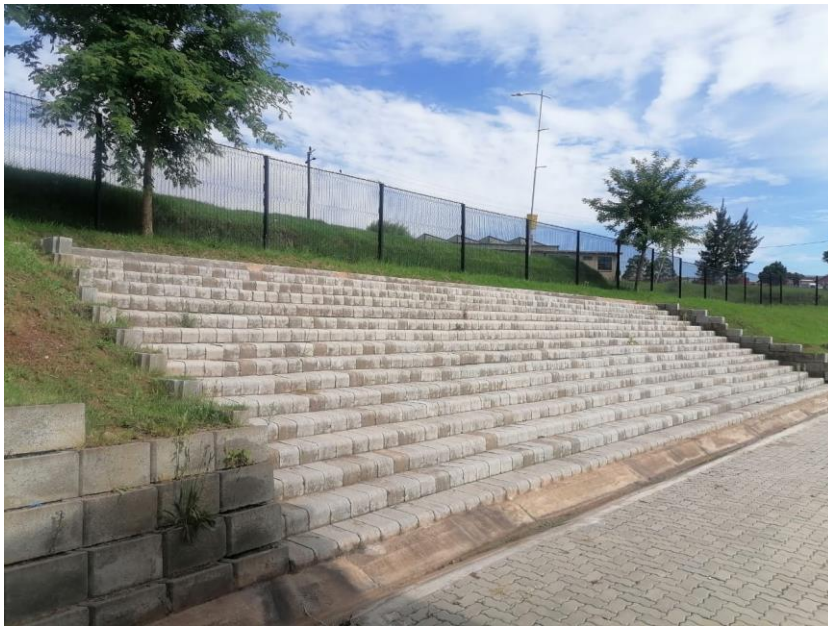
ILLUSTRATION: AREA TO BE SHADED 23M WIDE X 7M UPHILL