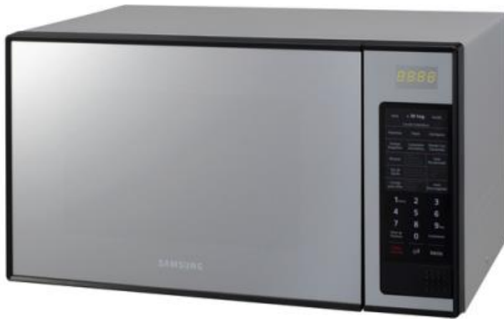
Microwave Oven 30 Litre