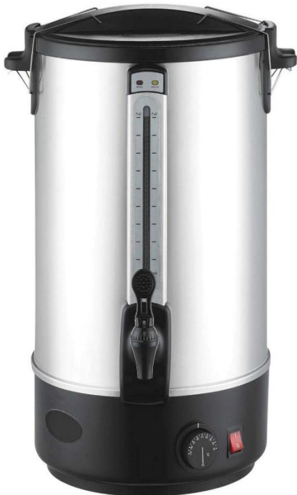
Urn 20 Litre