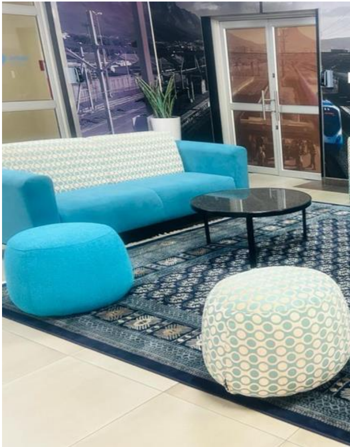
Two-Sitter Couch 2000x870