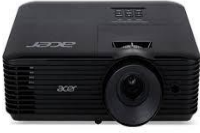
Boardroom Projector UHP I90- I60W 0.8 E20.9 ImageCare