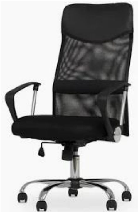
Office high back swivel chair