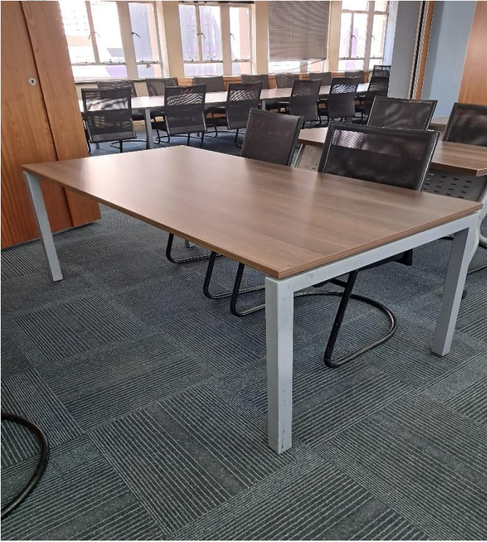
Four-Seater Boardroom table