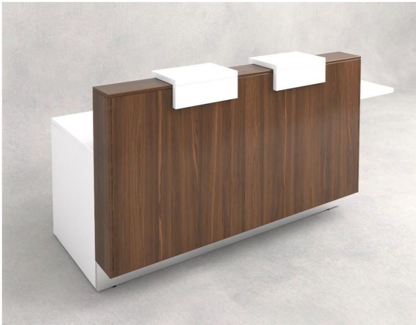
Reception Desk @ Main Entrance