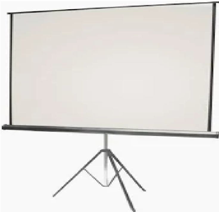
Tripod projection screen 2130x2130