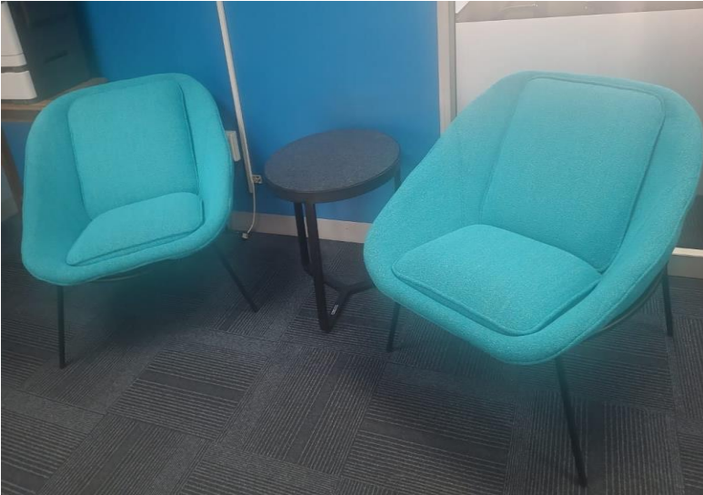
Visitors Chairs and a Side table