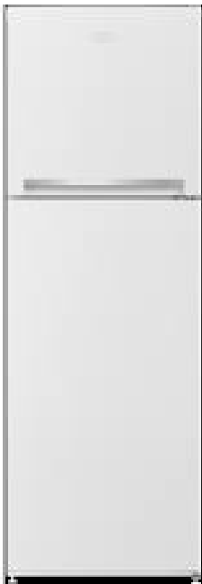
Top mount freezer 154 Litre