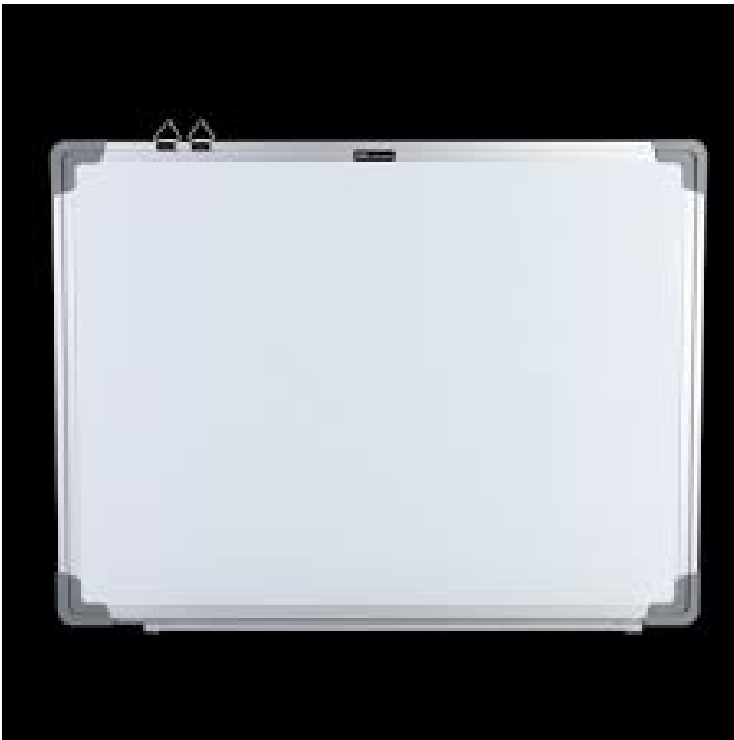
Magnetic White board 2400x1200