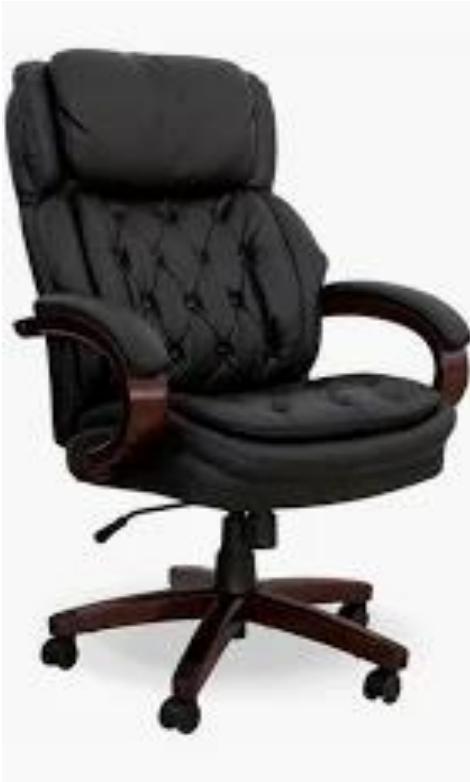
Executive high back swivel chair