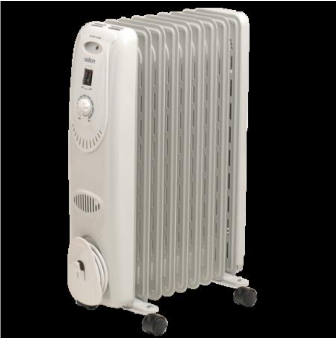
Oil heater 12 Fin