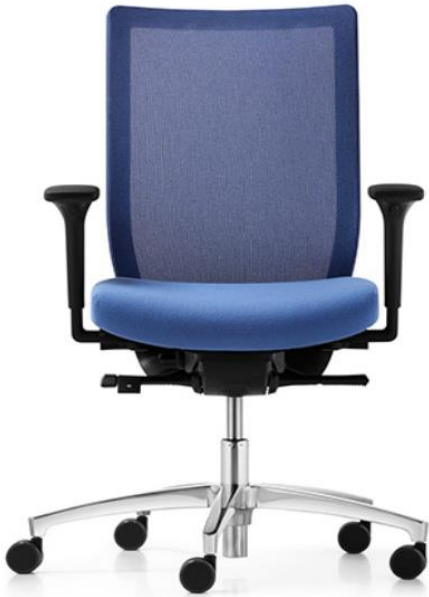
Main entrance high back swivel chair