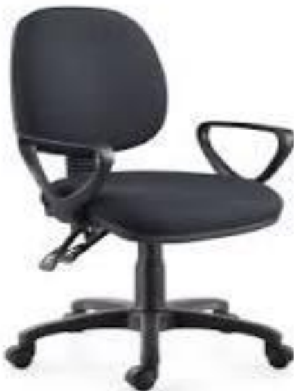
Secretariat chair (HB & S)