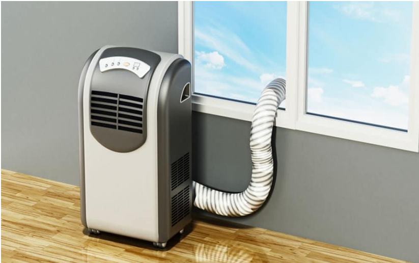
Portable Aircon 12000BTU