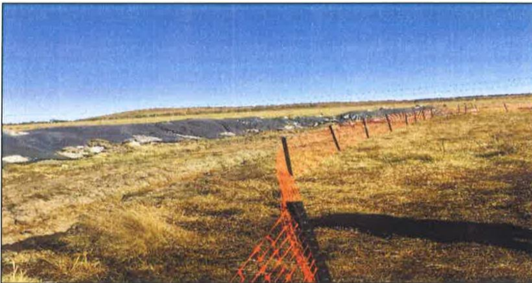
Figure 2: Snow net fencing on site.