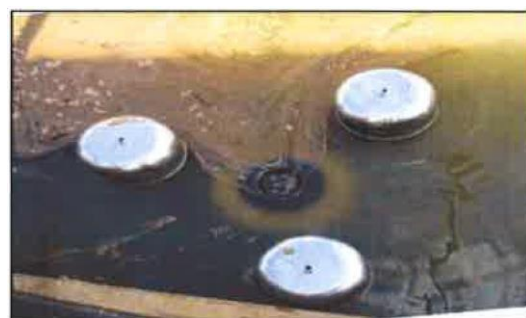
Figure 6: Floating Skimmer

Figure 5 and 6 above show pictures of a Super sucker and a floating skimmer.