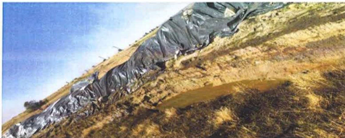
Figure 3: A typical cut-off trench

The Contractor is required to excavate cut-off trenches to contain the migration of the spilled product thus there may be a requirement to excavate multiple cut-off trenches for the technique to be effective.