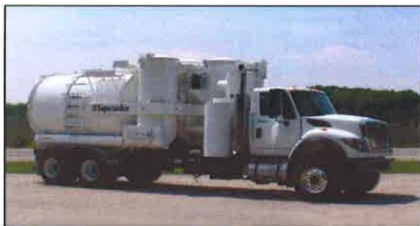
Figure 5: Super sucker

Temporary storage tanks (e.g. JoJo tanks, flow bins) may be used to allow for the recovered (presumably contaminated) product to stand for the separation of the product from the contaminants (water, soil, etc.).