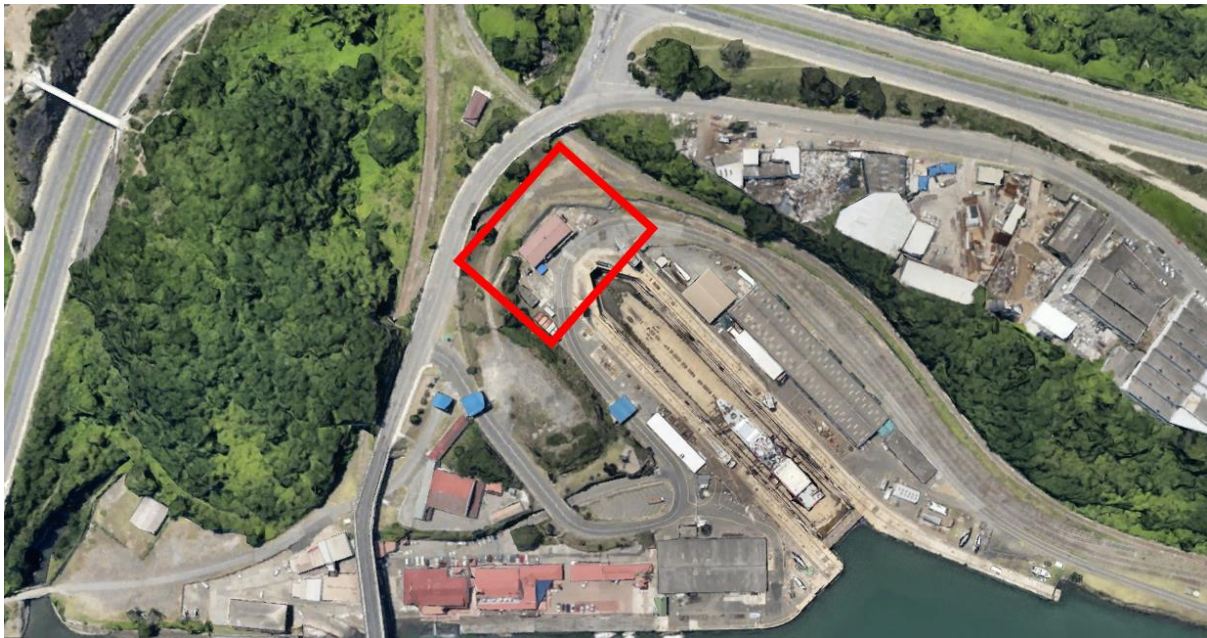
Figure 1: Manhattan building site

The Contractor will be responsible for the establishment of the site camp (at the location marked the figure below) and arrangements for accommodation. The establishment must be in accordance with Transnet's Environmental and Safety requirements. No accommodation is allowed in the site camp and or within Port of East London.