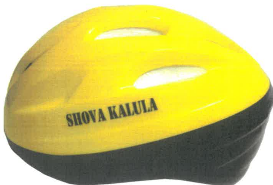
FIG 3. SPECIFICATION FOR TWELVE THOUSAND (12 000) SHOVA KALULA BICYCLE HELMET GM-105).