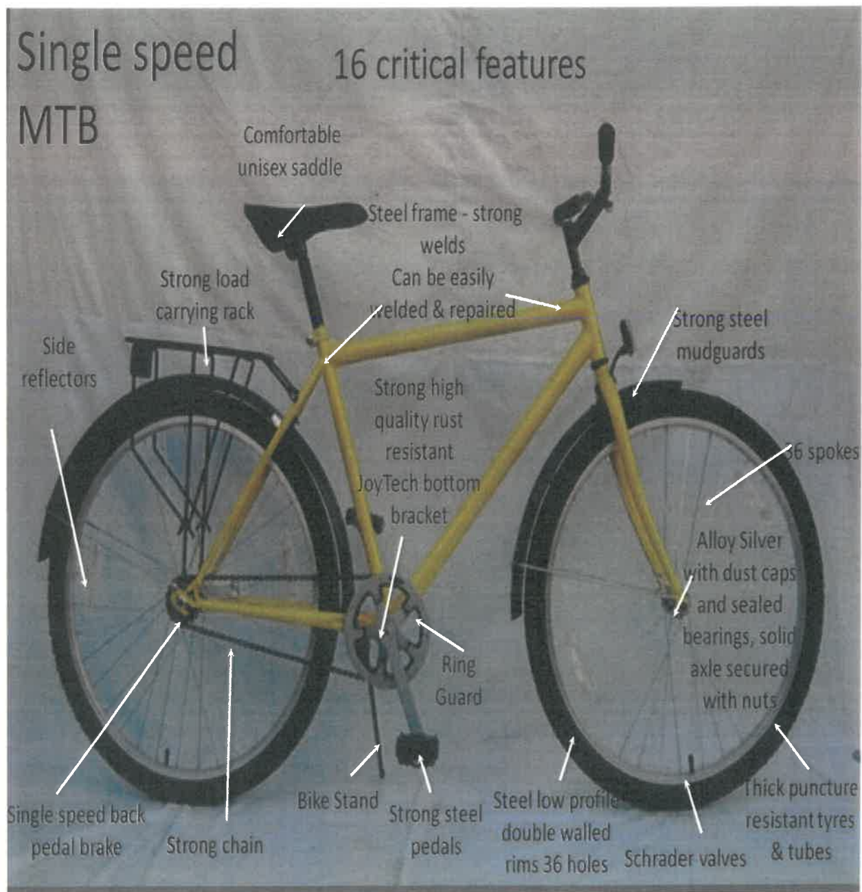
FIG 2: BICYCLE SPECIFICATION: SHOVA KALULA BICYCLE

The twelve thousand (12 000) Shova Kalula unisex bicycles shall comply with all specifications developed and approved by the Department as outlined in the table below: