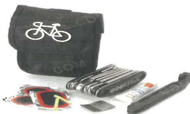
FIG 7. SPECIFICATION FOR PORTABLE AND MULTIFUNCTIONAL BICYCLE REPAIR TOOL KIT

NB: Note that bicycle helmets, pumps, locks as well as visibility safety lightweight cycling reflective vest must form part of the specifications and prices for these four (4) items must form part of the costing for the individual bicycle.