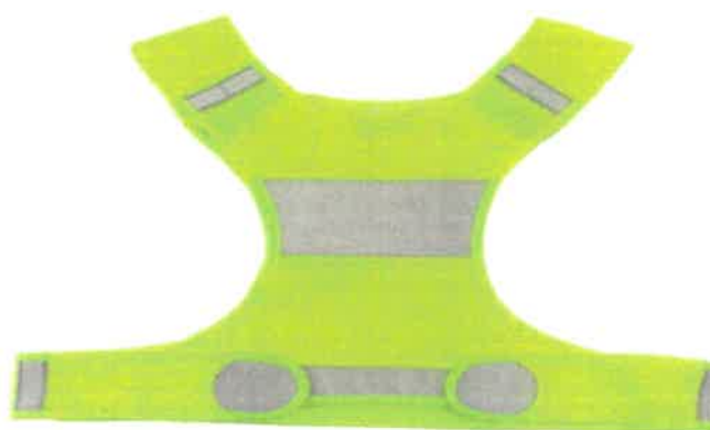
FIG 5: VISIBILITY SAFETY LIGHTWEIGHT CYCLING REFLECTIVE VEST