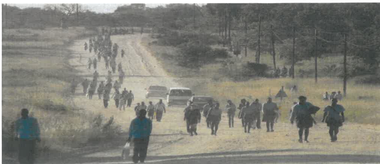
Fig 1: depict the plight of learners who walk long distances to access learning centers