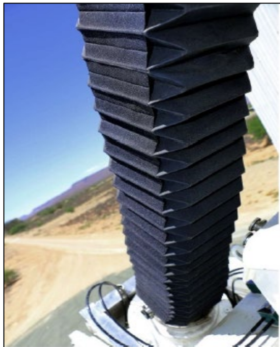
Figure 2 – Screw jack Bellow Image