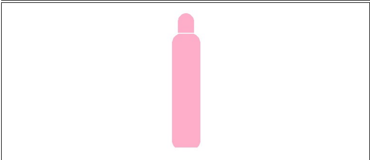
Figure 1: Protea 1020-Y80R colour painting of the cylinder