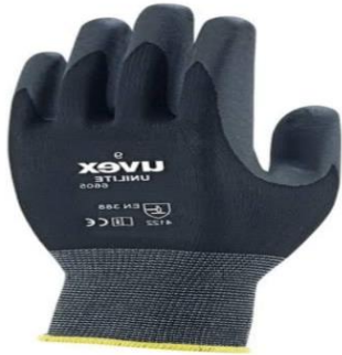
Hand Protection uvex Unilite Glove | Delta Health and...

GLOVES, MEN'S AND WOMEN'S; TYPE ELECTRICIAN, FEATURES 1000 VOLT PROTECTIVE, MATERIAL RUBBER