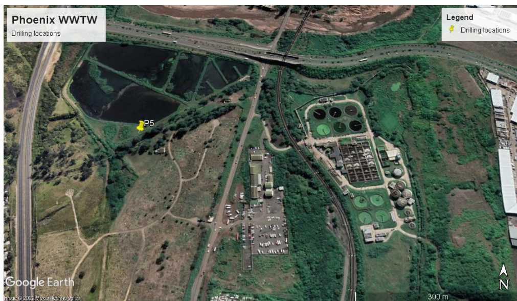
Figure 2. Drilling locations for Phoenix WWTW