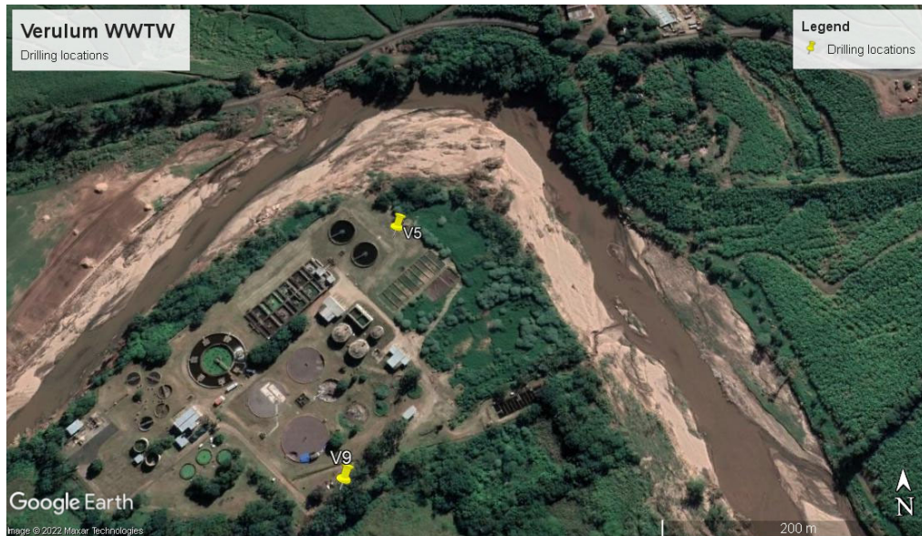
Figure 1. Drilling locations for Verulam WWTW