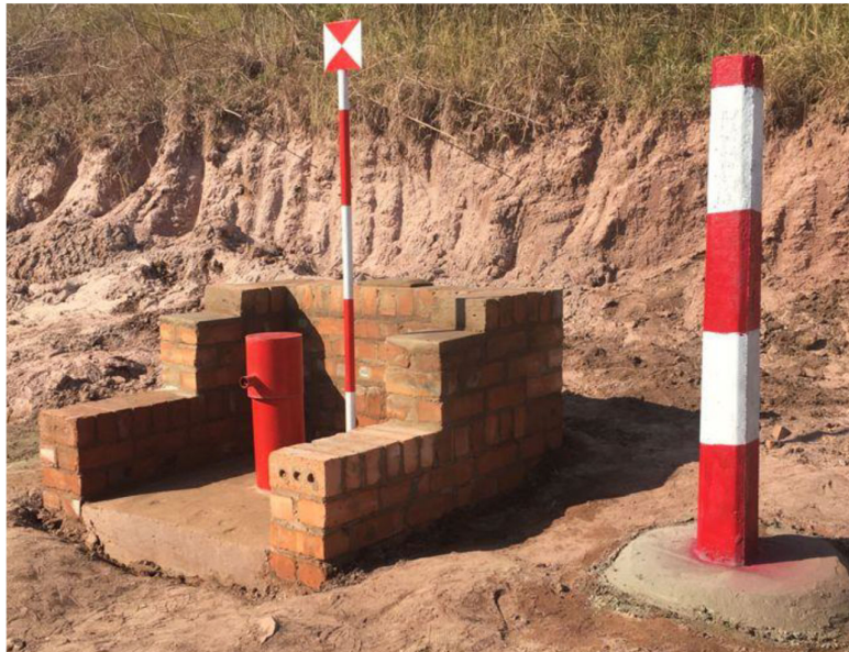
Figure 1. Final groundwater monitoring well construction