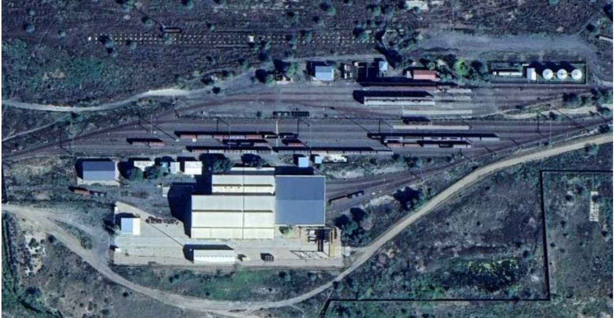
Figure 1: De Aar Depot Overview