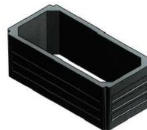
ISOMETRIC VIEW SCALE 1:20