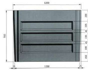
SIDE ELEVATION SCALE 1:10