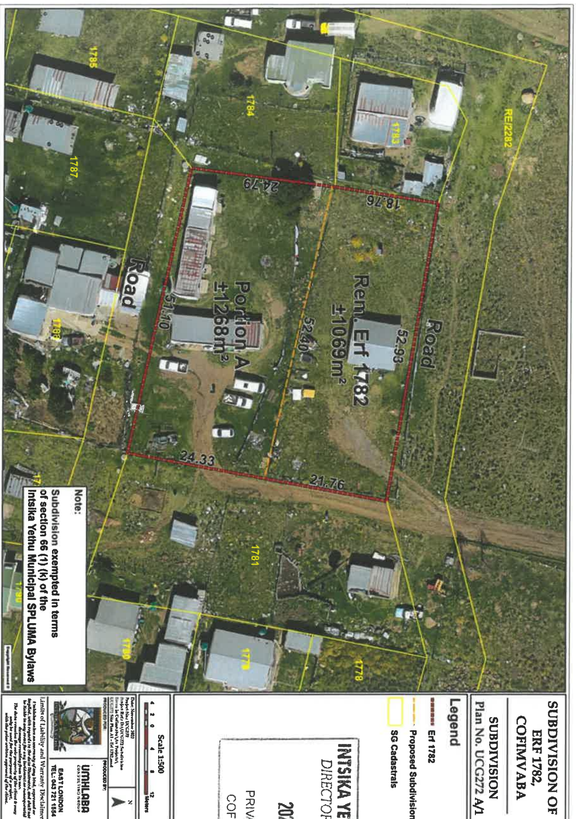
Plan 1: Subdivision Plan Erf 1782

Exemption: Erven 1782, 2225, 2232 & 2266 Cofimvaba – November 2022