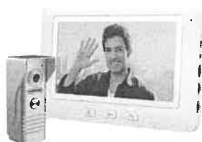
7" Color Video Doorphone RI-C07f