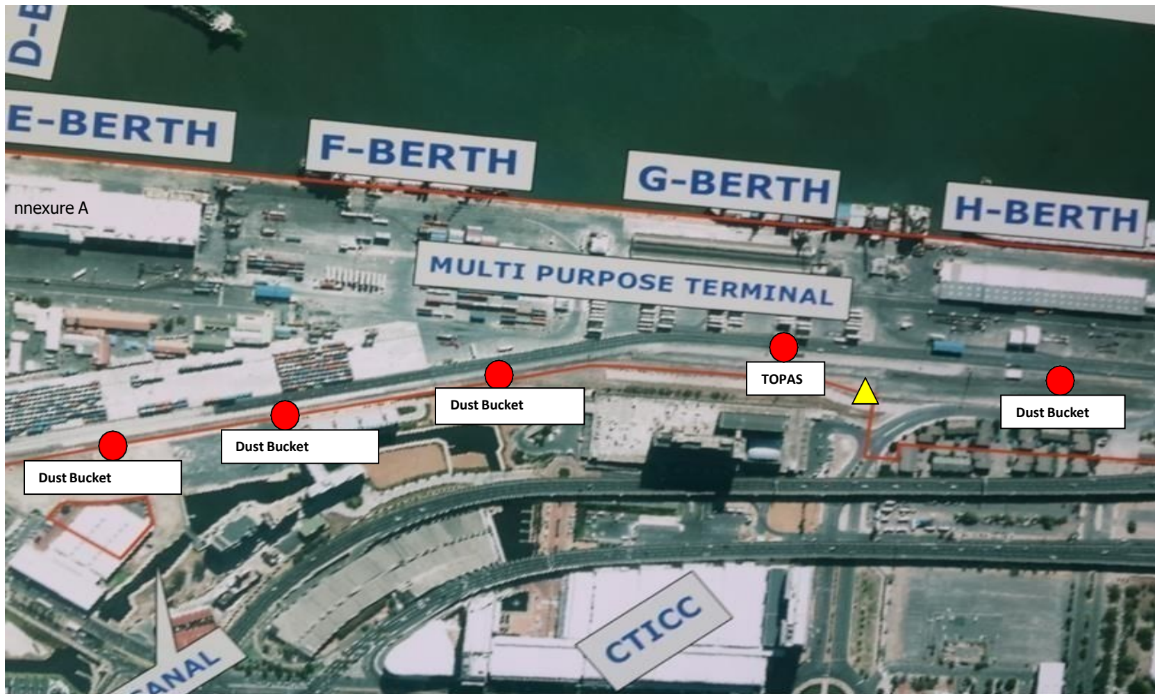
Figure 1: Location of Dust Buckets and TOPAS - Port of Cape Town, Multi-Purpose Terminal.

Confirmation that office falls within the Western Cape Region on company letterhead or utility bill.