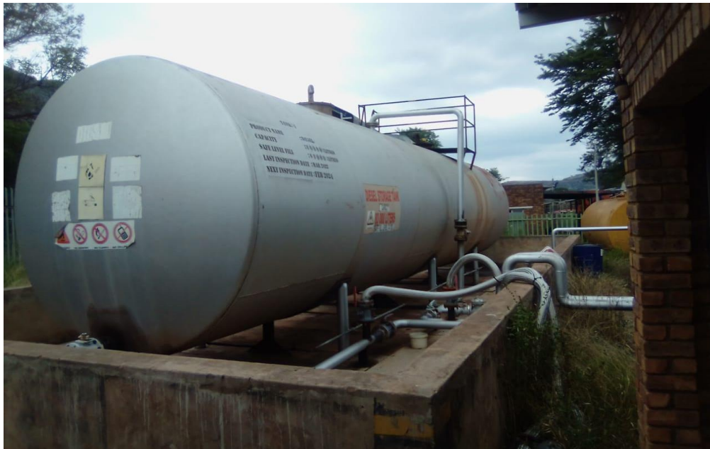
Thabazimbi Horizontal Tank