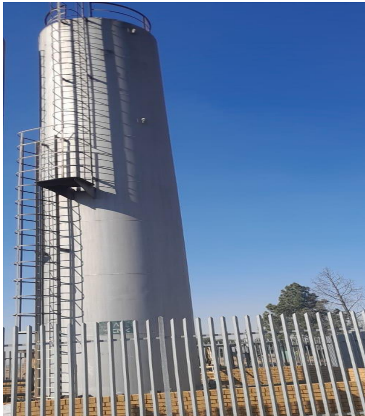
Sentrarand Vertical Tank