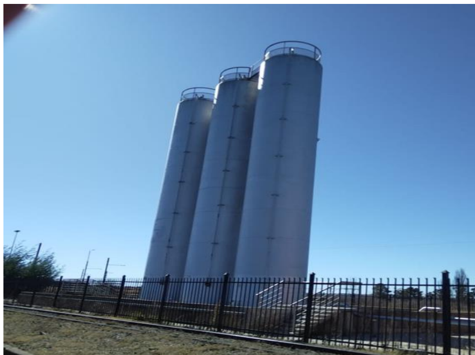
Bethlehem Vertical Tank