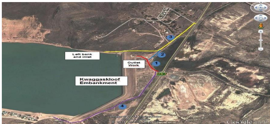
Figure 3: Plan view of Kwaggaskloof embankment (Google Earth, 2013)

As illustrated in the Figure 3, access to the downstream toe of the dam wall, the right downstream side of the outlet works, and the pump station is gained via a short section of existing gravel road which runs from the R43 road (Worcester/Villiersdorp) turn-off ( route 1 ). Access to the left side of the outlet works Non-Overspill Crest (NOC) and inlet works can be provided through an access bridge over the outlet works canal ( route 2 ) or an alternative gravel road which can also be accessed from the R43 road ( route 3 ). Access to the right downstream toe or the Dam for recreational purposes is controlled by means of the Kwaggaskloof Waterski Club.