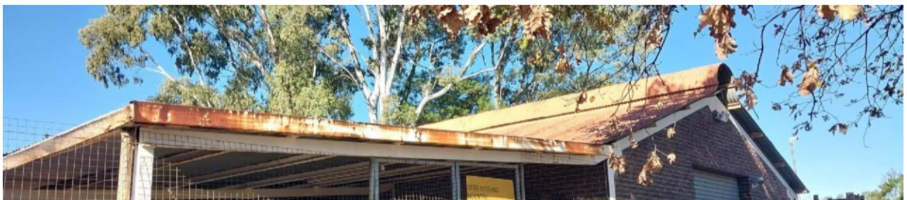
Figure 4 A VIEW OF STEEL FRAME AND GUTTERS / DOWN PIPES, ROOF COVERING