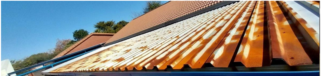
Figure 3 RUSTED IBR SHEETING