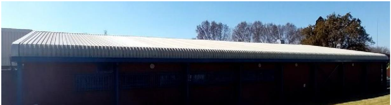
Figure 1KROMODEK ROOK COVERING