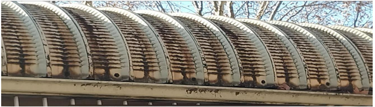
Figure 2 KROMODEK ROOF