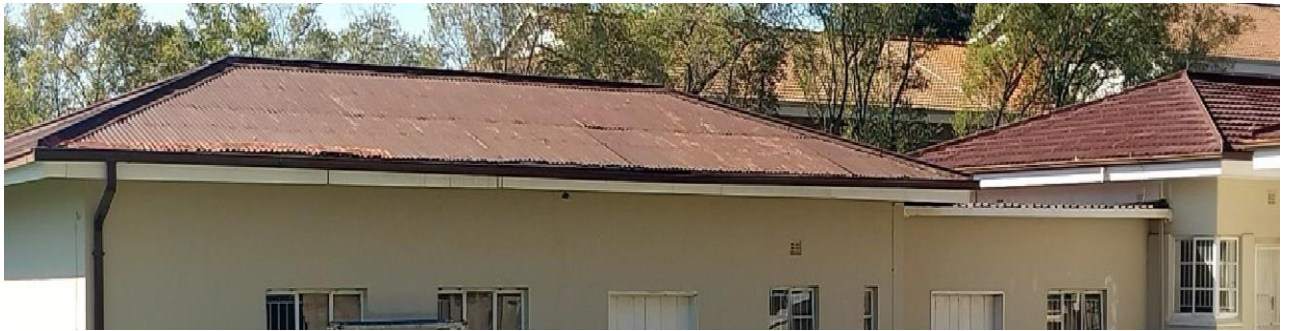
Figure 6 CORRUGATED ROOF TO BE REPLACED WITH HARVEY TILES (EXISTING ROOF NOT TO BE REMOVED)

EXAMPLE FOR THOSE WITH QUESTIONS (IT IS POSSIBLE)