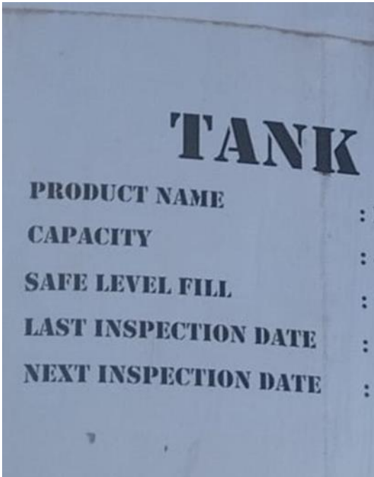
Figure 2: Tank labelling reference