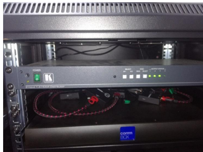
Kramer HDMI distributor (2 HDMI input / 4 HDMI output)