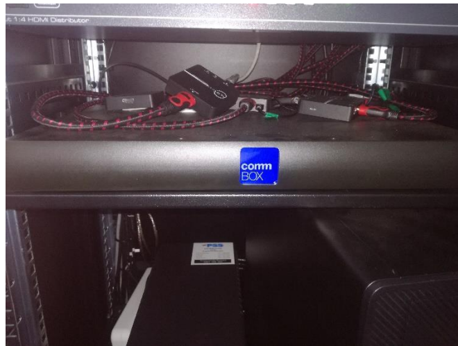
Commbox Pro Automation system