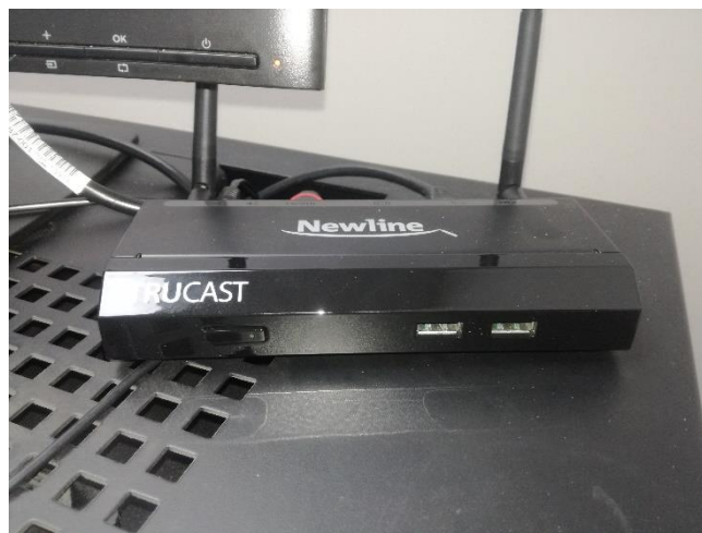
Wireless interactive power over ethernet (POE) device