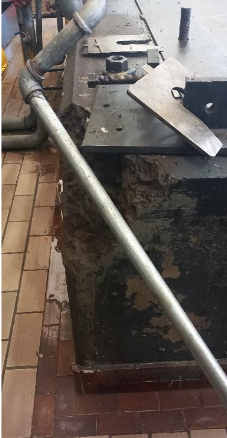
Main Pump 21 – 2 nd Stage