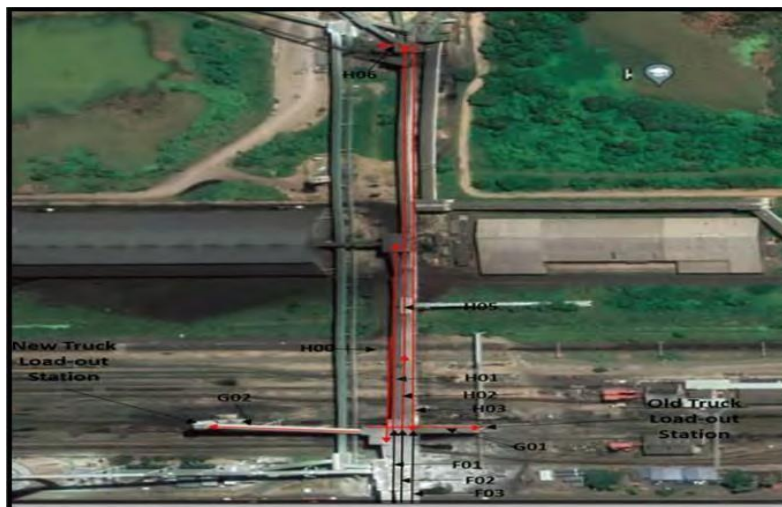
Figure 5 - Aerial Image 3: View of Conveyors and Galleries