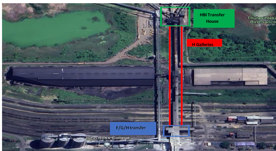
Figure 1 - Aerial Image