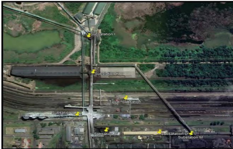
Figure 4 - Aerial Image 2: Substations Area View