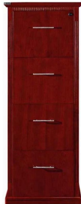
Four Drawer Filing Cabinet