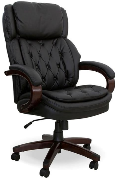
President High Back Office Chair