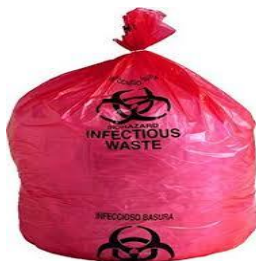
Figure 1: 80 Micron Red Plastic Bags

The supplier shall provide impermeable, tightly sealed containers or 80-micron red plastic bags together with a securing mechanism (e.g. cable ties) large enough to contain all the garments to be laundered. There should be sufficient containers or plastic bags, clearly marked with a biohazard label as depicted in picture below (Figure 1), as required by the Regulations for Hazardous Biological Agents and will be delivered to the facility for their use with each delivery.